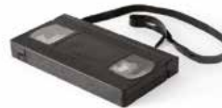
Photo slideshows Audio tape to CD/MP3 DVD to MP4