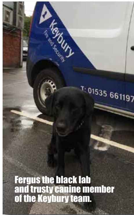
Fergus the black lab and trusty canine member of the Keybury team.

So what do we do that leaves our customers so relaxed? We install and maintain security systems and Fire Protection systems...And we're passionate about it! We're proud of our history but always looking forwards for the latest innovations to bring new technology to our customers. We work to the highest industry standards, and are NSI Gold Approval for installation and maintenance of Security Systems and Fire Alarm Systems.